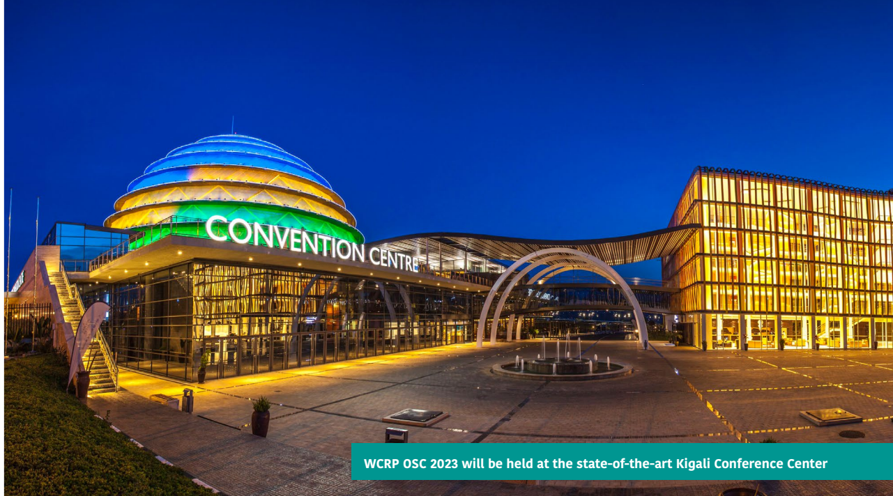
WCRP OSC 2023 will be held at the state-of-the-art Kigali Conference Center

Come join us to learn about the new WCRP, share your ideas, and meet with colleagues from around the world.