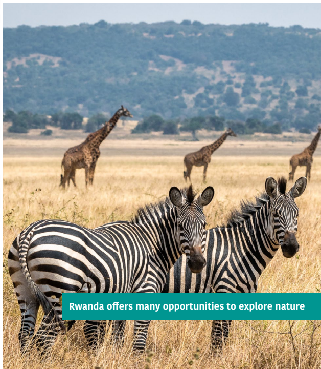
Rwanda offers many opportunities to explore nature